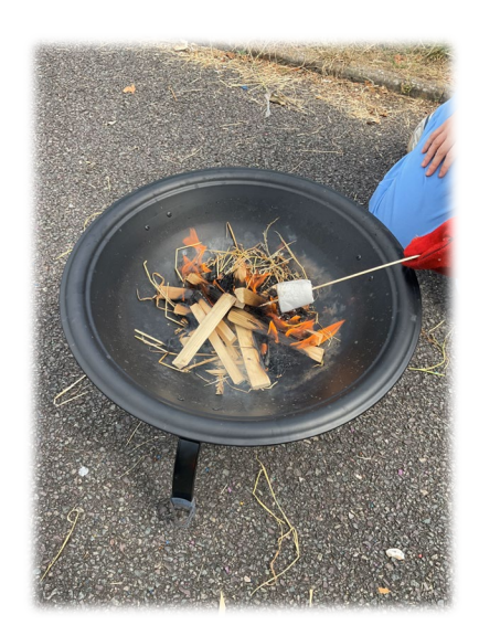
Snowdrops safely lit a fire using flint stones.

For History, we're working on understanding past and present societies, including, with adult support, starting a fire using flint.