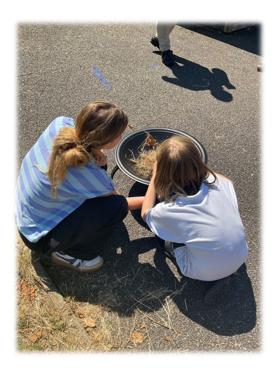
Bluebell class risk-assessed, prepared and independently lit a fire.

In English, we have been looking at non-fiction texts and creating personal profiles. Our highlight has been learning how to safely create a fire. We have undertaken risk assessment training, risk assessed the fire pit and collected kindling to prepare a fire. We have then lit the fire by ourselves, using flint stones.