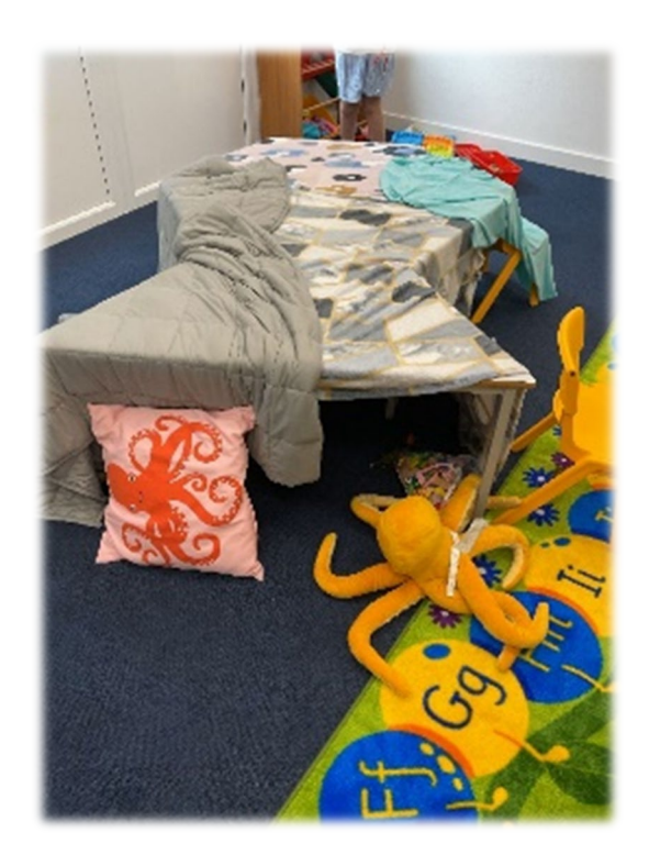
Den building in Snowdrops class

Snowdrop class is working amazingly well. We've been planting and will soon be studying wild and common plants for Science. This week we built our own den.