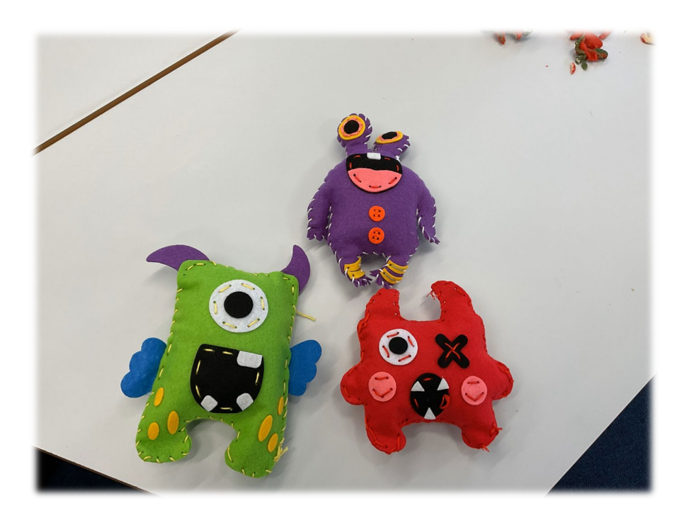
In DT, Snowdrops showcased their fine-motor skills by making monsters.