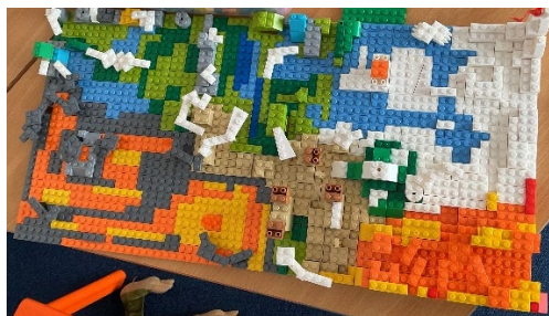
Bluebell class creating Lego plant-based structures